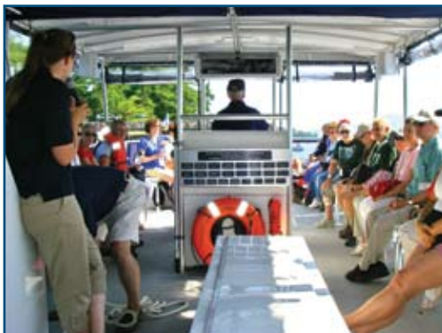
Above: A group from the Family Nature Summit held at Silver Bay YMCA joined us for a Floating Classroom trip at the end of July.