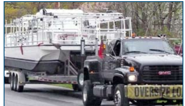
Thanks to our dedicated volunteers, the boat was ready to go in just a few short weeks!

This fall was also very busy with school field trips in September and October. Students from Queensbury, Lake George, Whitehall, Bolton, Ticonderoga, Minerva, and the Southern Adirondack Education Center all participated in the program aboard the new boat.